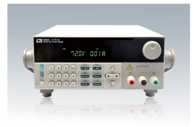
IT6833A Programmable DC power supply

IT6830A series power supplies are single output programmable DC power supplies. Their high resolution 1mV/0.1mA,adjustable output time fuction,supporting panel list programming procedures, OVP/OTP protection fuctions, provides your test great convenience. With built-in USB and RS232 interfaces, they can be used both on the table and systematic, that offer multi-purpose solutions, based on your design and testing requirements.