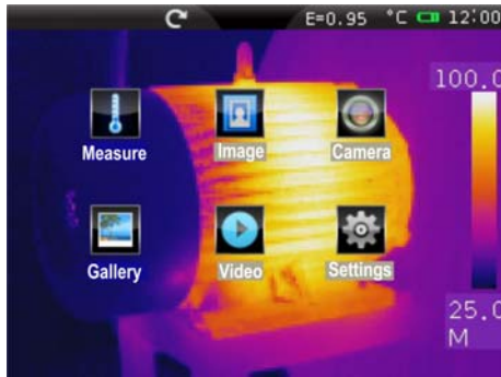
General menu with icons

The THT60 model is a advanced infrared camera with capacitive touch-screen TFT color display for quick and intuitive advanced use from any kind of thermograph operator