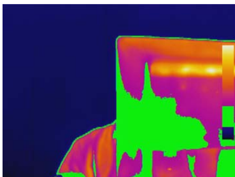
Advanced analysis: Isotherm feature