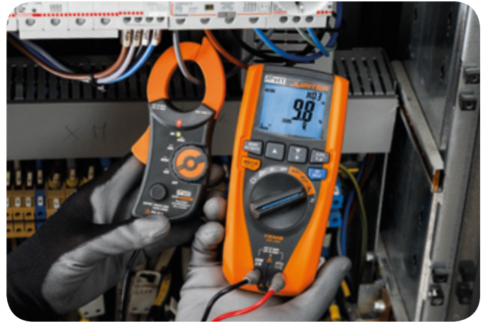
Current harmonic measurement.