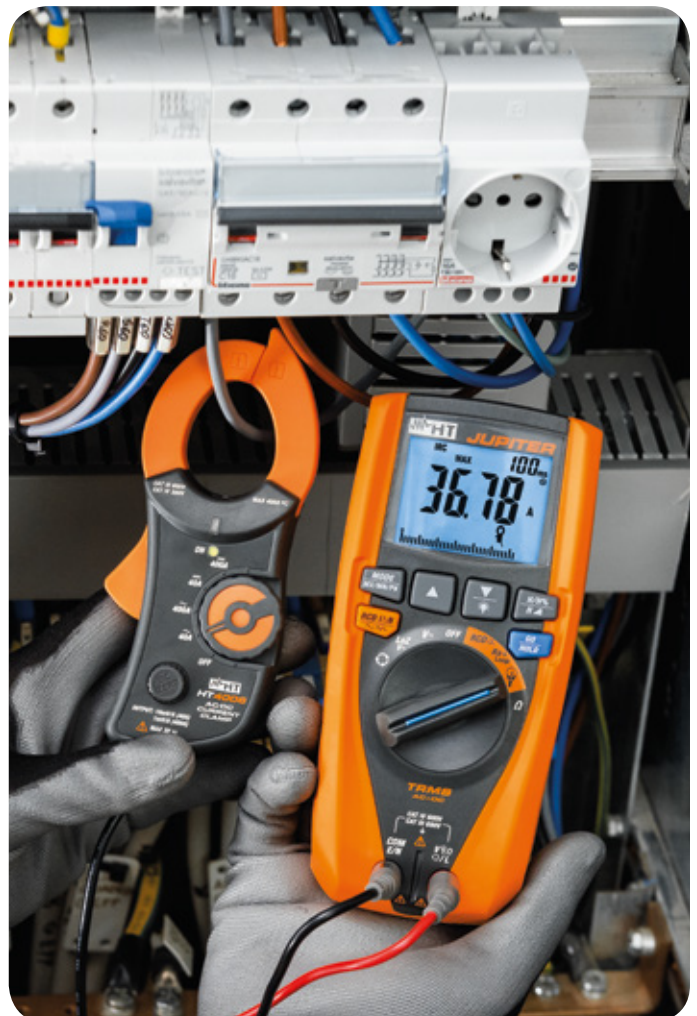
Inrush Current measurement.