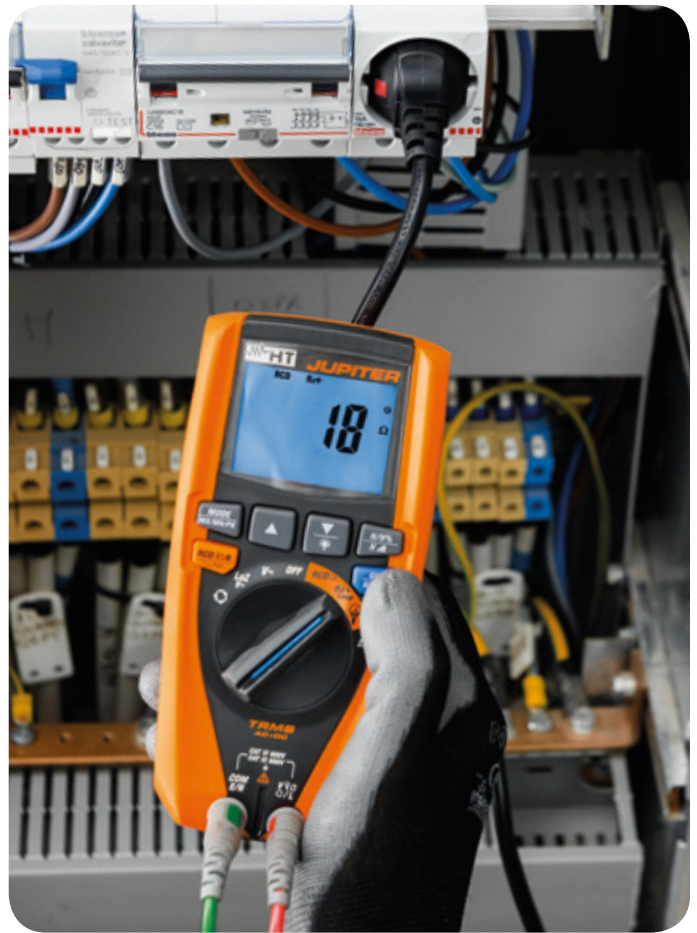
Non-trip earth ground resistance measurement.