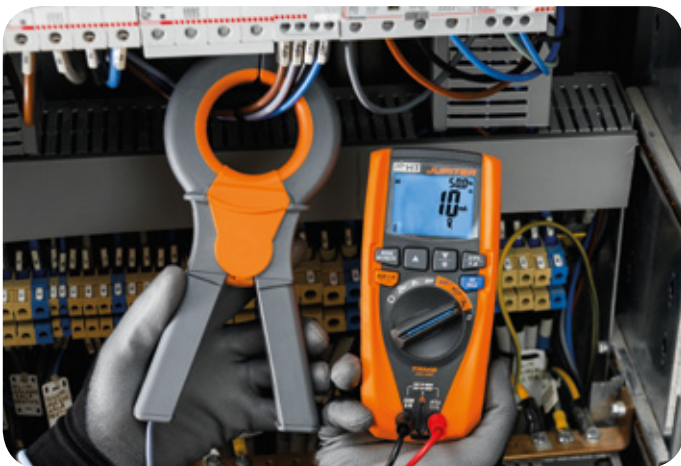
Leakage current measurement.