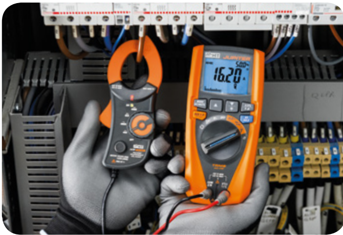
TRMS AC+DC current measurement.