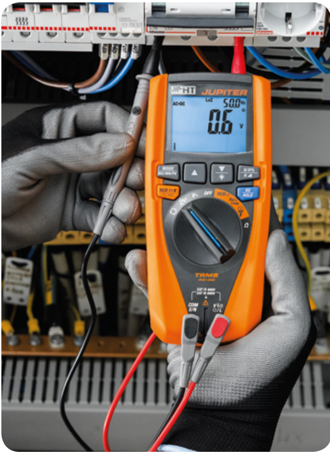
Ghost voltage cancellation.