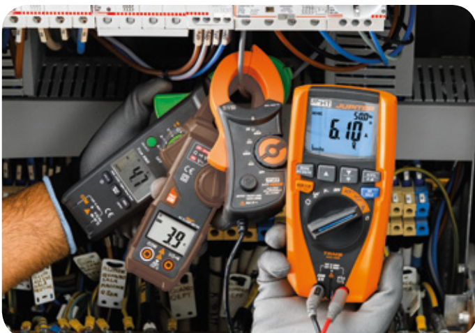
Measurement comparison: 3.9A: with RMS clamp - 4.7A: with TRMS clamp 6.1A: correct reading with AC+DC TRMS clamp.