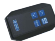
IR remote controller SIR-15