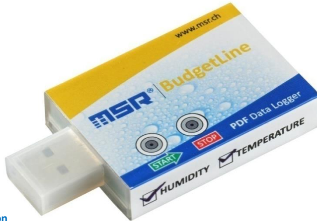
2.0 A-Type USB Connection